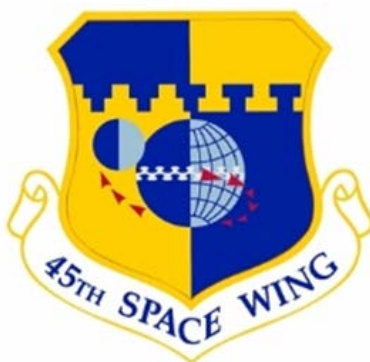
Historic Emblem of the 45th Space Wing

On Oct. 1, 1990, the Eastern Space and Missile Center and control of all operational space lift vehicles was transferred from Air Force Systems Command to Air Force Space Command, with the goal of establishing a new operational wing to oversee Eastern Test Range operations. The new operational wing was established as the 45th Space Wing on Nov. 12, 1991.