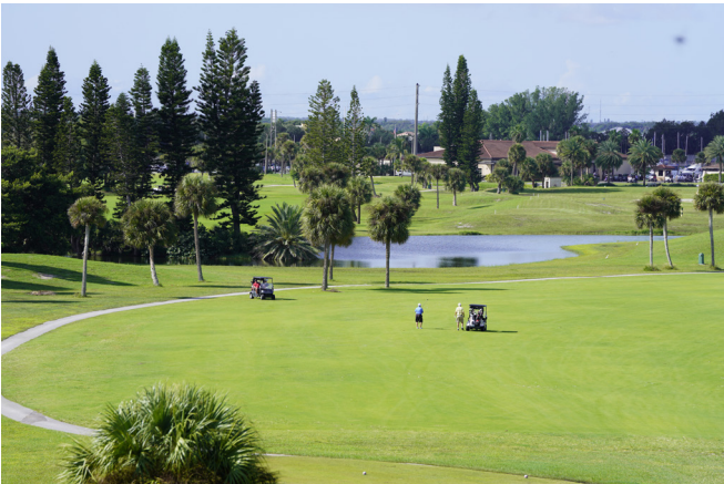
Tee times may be blocked for approved tournament or league play only.